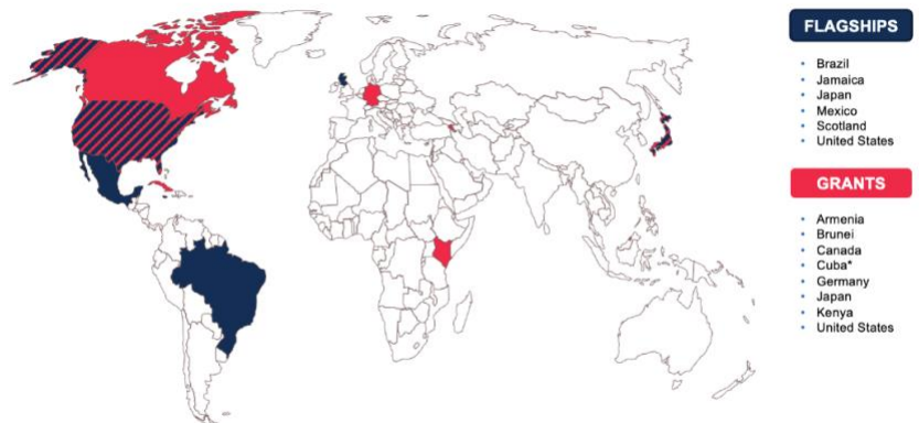
Early Detection Footprint: 19 Programs, 12 Countries

Over 75 applicants from 24 countries responded to DAC Healthcare System Preparedness's inaugural grant funding for improving early detection of Alzheimer's disease.